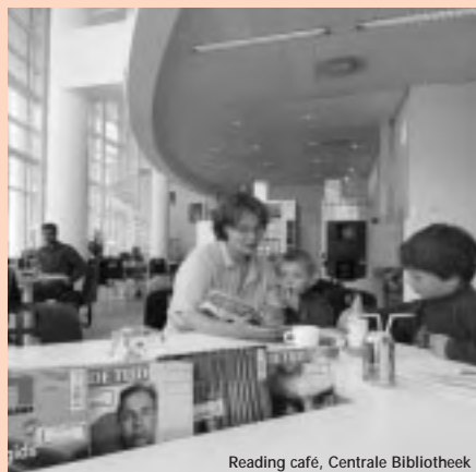
Reading café, Centrale Bibliotheek

Special days with story-telling and multicultural dictation The local PEUTERMAAND (Toddler's Month) got many playgroups and day-care centres going: they started the National