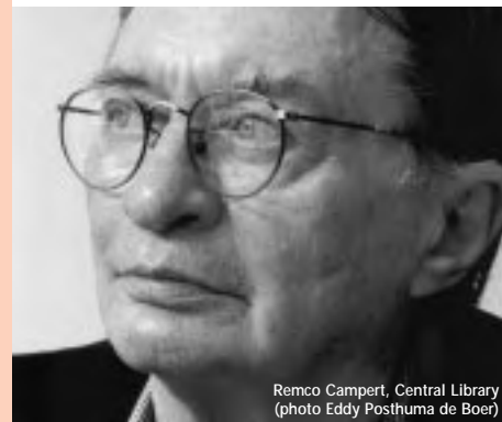
Remco Campert, Central Library