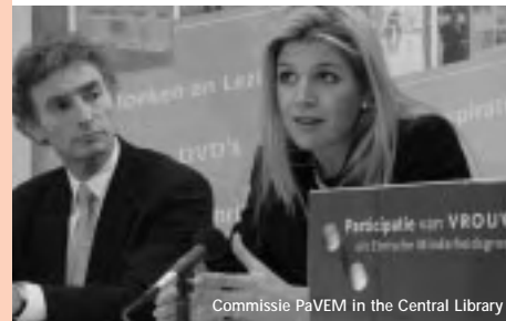
Commissie PaVEM in the Central Library

Măxima visited The Hague library twice in 2004. In March, she came to the Schilderswijk library as honorary member of the committee Participatie van Vrouwen uit Etnische Minderheden PaVEM (Participation of Women from Ethnic Minorities), which participated in the project Kleurrijk talent (Colourful talent). She made an appeal to Dutch women to teach foreign women. She was offered a subscription for her daughter Catharina Amalia at this occasion. The committee PaVEM held a press conference about the plan Taal Totaal (All about Language) in the Central Library, where Princess Măxima was one of the speakers.